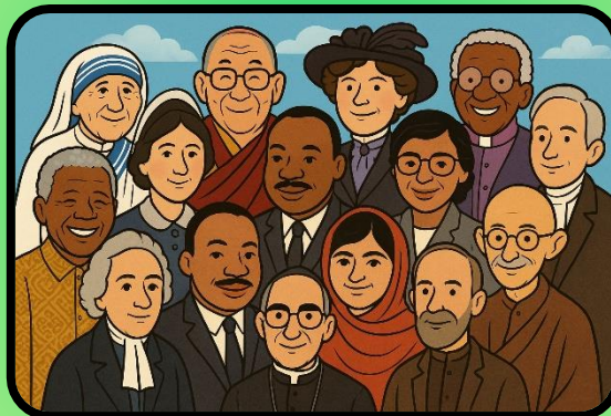
Mother Teresa, the Dalai Lama, Emmeline Pankhurst, Desmond Tutu, Nelson Mandela, Florence Nightingale, Martin Luther King Jr., Rosa Parks, Oskar Schindler, William Wilberforce, Oscar Romero, Malala Yousafzai, Alfred Nobel & Gandhi

Children explored the lives of inspiring individuals who have done just that, including: